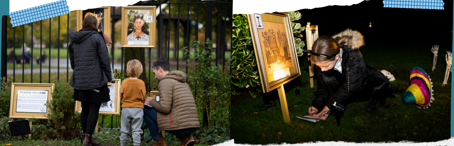
We can light the art trail so it is still visible at night with solar-powered lights

At festivals, the trail is a useful way of signposting when the Creative Missions are happening, as well as enriching the general festival environment with curious and intriguing art.