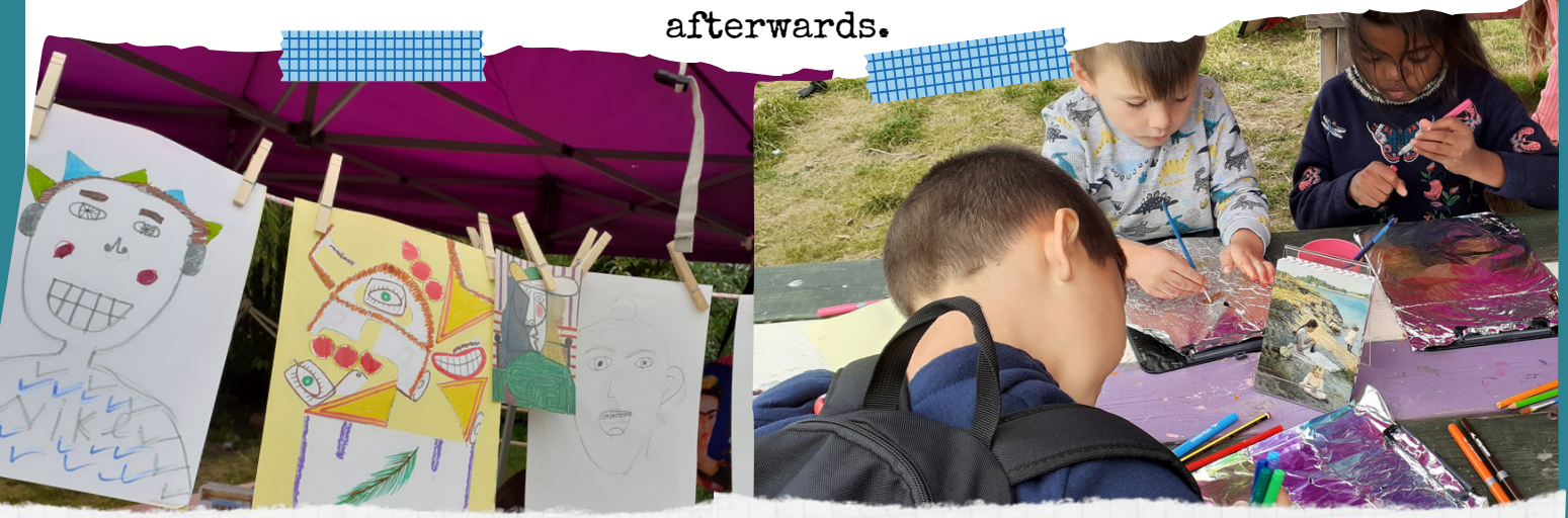
Picasso-inspired art by Creative Agents in Hartcliffe, south Bristol

We sometimes provide simple voice recorders and prompt questions so participants can anonymously give feedback on the session immediately