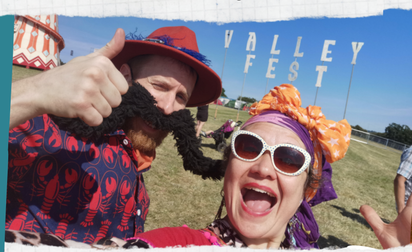
Agents Dali & Kahlo at ValleyFest